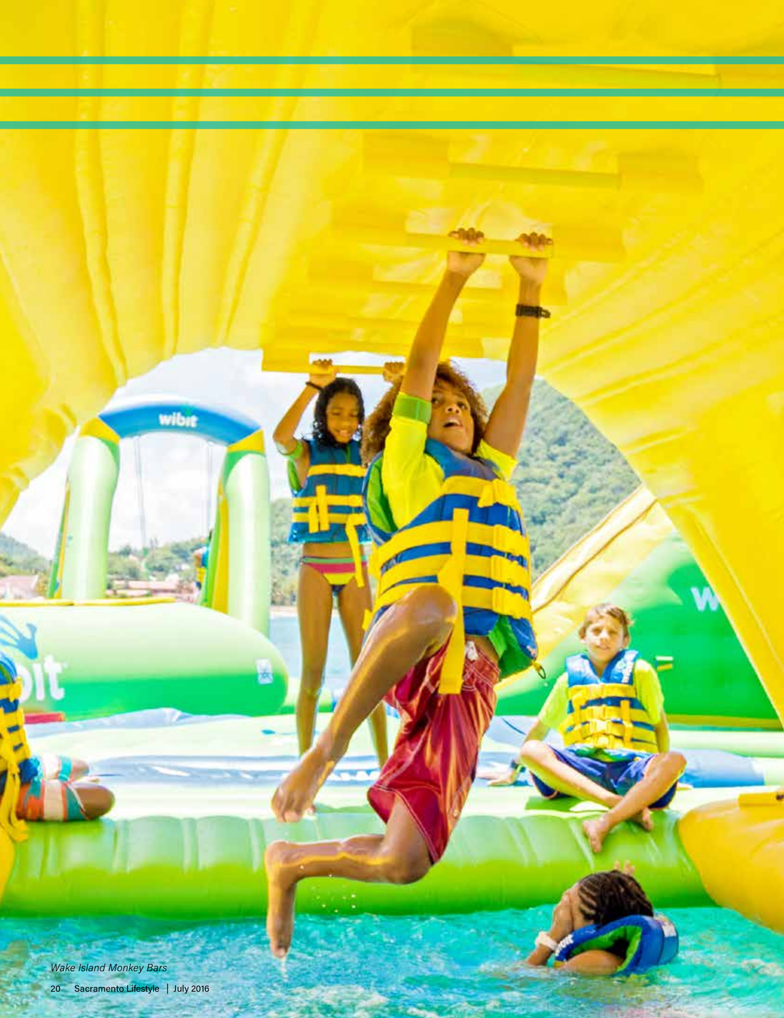
Wake Island Monkey Bars