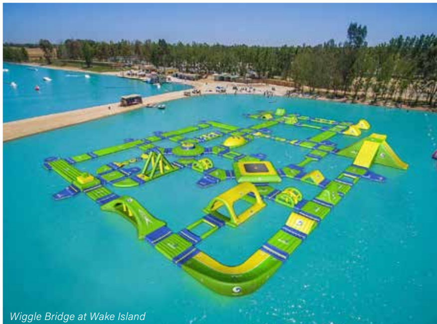
Wiggle Bridge at Wake Island

A day at Wake Island is guaranteed to be a memorable day, whether you choose to challenge each other on the new Aqua Park (an enormous inflatable obstacle course), try cable wakeboarding or rent a stand up paddleboard. Families have fun with pedal boats, turbo paddlers and corcls, which are floating saucers that you can sit or stand on. The swimming beach is a great place to relax and watch the watersports, right next to Beach Hut Deli and Island Grill.