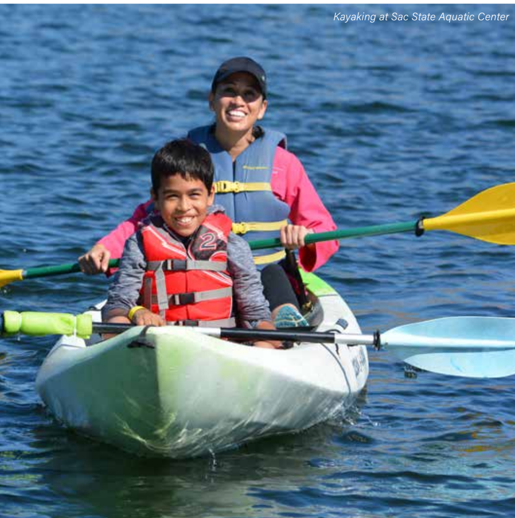
Kayaking at Sac State Aquatic Center