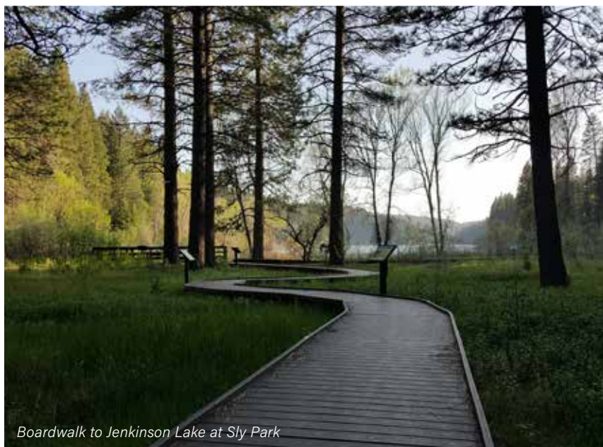
Boardwalk to Jenkinson Lake at Sly Park

Whether it's a relaxing day at the lake or a fun-filled adventure to a water park, a stay-cay in Sacramento and nearby areas is bound to be a great day!