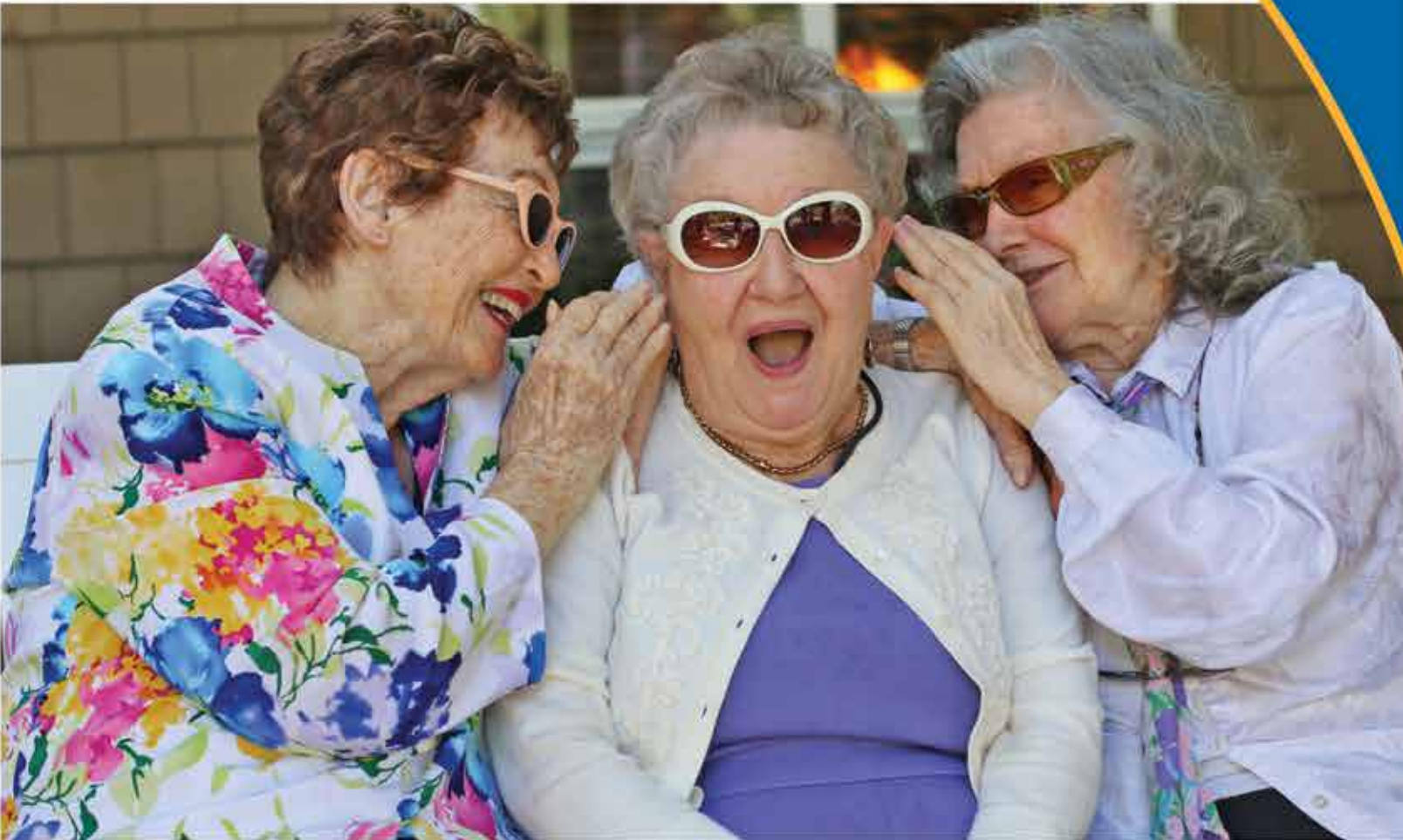
Real friends share a secret at Eskaton Lodge Granite Bay

Experience the Eskaton difference. Call a community or go online now.