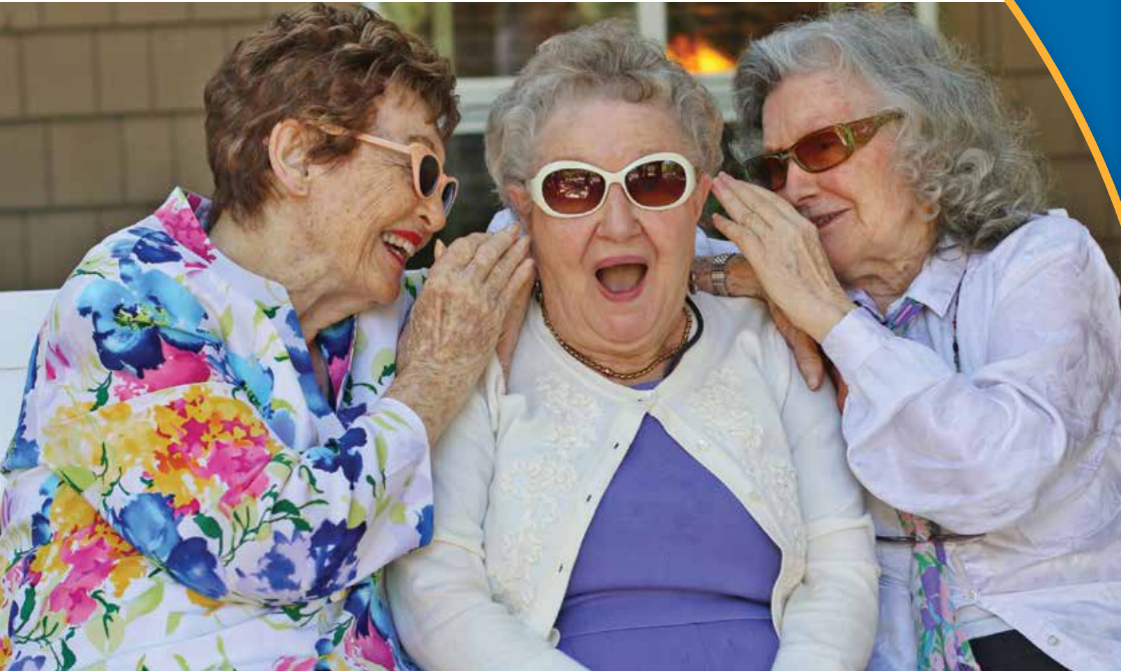
Real friends share a secret at Eskaton Lodge Granite Bay

Experience the Eskaton difference. Call a community or go online now.