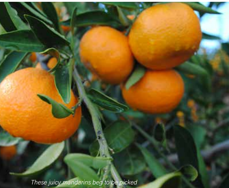
These juicy mandarins beg to be picked